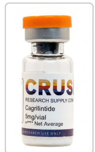
Cagrilintide 5mg - CRCAG-5-2604-1

The sample was confirmed to be Cagrilintide by HPLC. Identification by chromatographic retention time comparison with a reference standard.