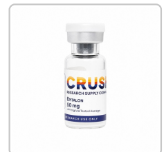
EPITALON 50mg - CRET-50-0212-1