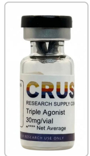
Triple Agonist 30mg - CRRT-30-2604-2

The sample was confirmed to be Triple Agonist by HPLC. Identification by chromatographic retention time comparison with a reference standard.