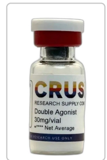
Double Agonist 30mg - CRTZ-30-2604-1

The sample was confirmed to be Double Agonist by HPLC. Identification by chromatographic retention time comparison with a reference standard.