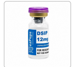
DSIP 12mg - DS100319