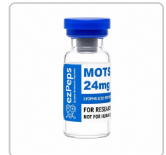
MOTS-C 24mg - MO200329