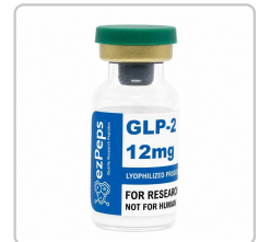
GLP-2-TZ 12mg - ZE100402