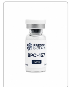
BPC-157 10mg - BPC-A319