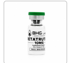
Retatrutide 10mg - BHG-R10-001