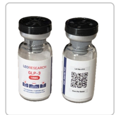
GLP 10mg - #1111