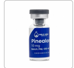
Pinealon 10mg - PNL-010-MH-01