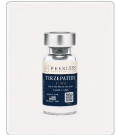
Tirzepatide 10mg - 08-2606