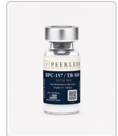
BPC-157 / TB-500 10x10mg - 13-2606