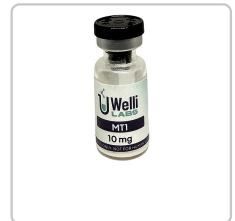
Melanotan-I 10mg - M210-01-10001