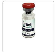
AOD 5mg - WLAOD-5-1003