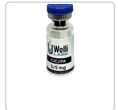
CJC/IPA 5mg / 5mg - WLCP-10-1005