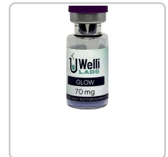
GLOW 70mg - WLGLO-70-1004