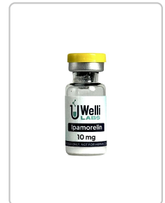
Ipamorelin 10mg - WLIPA-10-1002