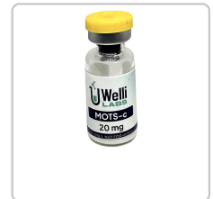
MOTS-c 20mg - WLMTS-20-1002