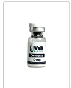
Oxytocin 10mg - WLOXT-10-1003

Date Tested: 04/10/2026 | Method: Full QC Panel