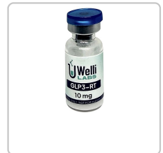
Retatrutide 10mg - WLRT-10-1011