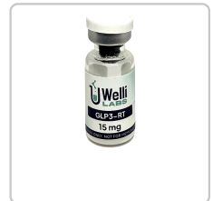
Retatrutide 15mg - WLRT-15-1001