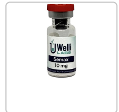
Semax 10mg - WLSMX-10-1003