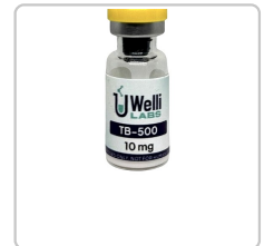
TB-500 10mg - WLTB-10-1002