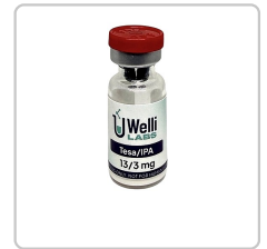
Tesa/IPA 13mg/3mg - WLTIP-16-1002