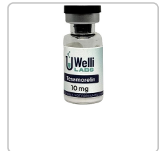
Tesamorelin 10mg - WLTA-10-1005