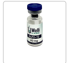
Tirzepatide 40mg - WLTZ-40-1001