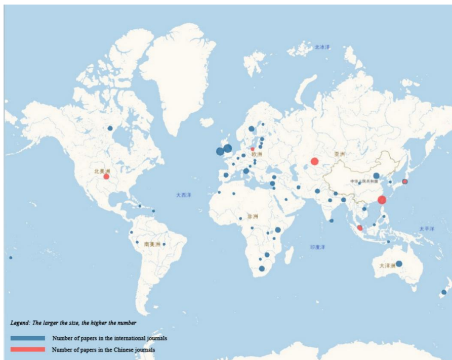
Figure 6. Geographical distribution of LPP studies (2002–2017)

158 articles were categorized as specific studies with a geographical focus on the local context, comprising 125 studies in the international journals and 33 in the Chinese journals. The data comparison of the geographical distribution of LPP studies in Chinese and international journals is shown on a world map by in Figure 6.