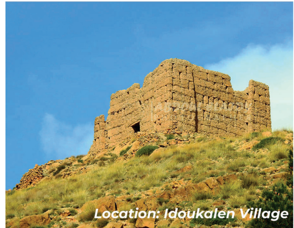
Location: Idoukalen Village

The collective granary of Sidi Moussa, a UNESCO heritage site, and the granary of Sidi Chita offer a breathtaking view of the mountains and the valley! These circular constructions, more than 300 years old, were fortresses used to store crops and valuable goods, as well as shelters to defend against invasion from enemy tribes. A comfortable trail will lead you from the villages of Timit or Ichougane to the Sidi Moussa granary. You can visit the granary and its small museum, enjoy a cup of tea prepared by the caretaker, or have a picnic on-site.