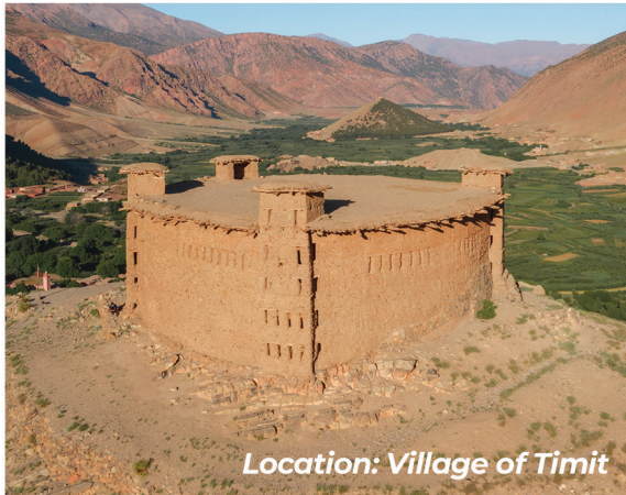
Location: Village of Timit